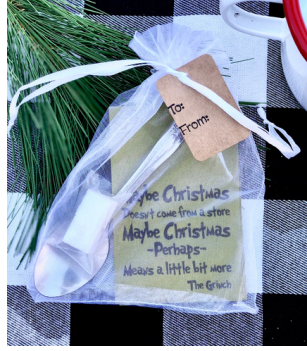
Maybe Christmas Doesn't Come From a Store