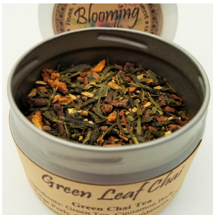
Green Leaf Chai

Green Tea, Natural Ginseng Flavor and Ginger Root