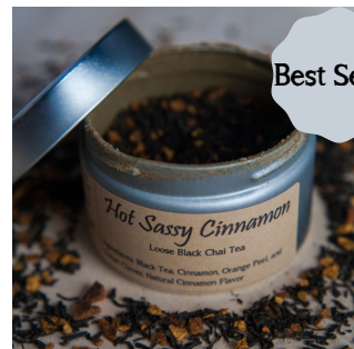
Hot Sassy Cinnamon Black Tea, Cinnamon, Orange Peels, Cloves, and Natural Cinnamon Flavor,