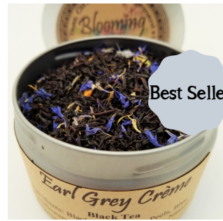
Earl Grey Crème Black Tea, Orange Peels, Blue Cornflowers, Natural Vanilla, Bergamot and Crème Flavors