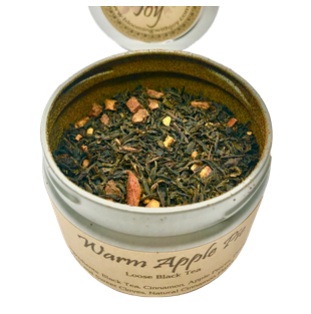
Warm Apple Pie

Oolong Tea, Natural Peach Flavor, Apple Pieces, Marigold Flowers and Apricots