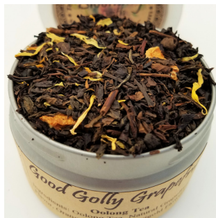
Good Golly Grapefruit Oolong Tea, Orange Peels and Marigold Flowers, Natural Grapefruit Flavor