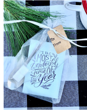
The Most Wonderful Time of the Year