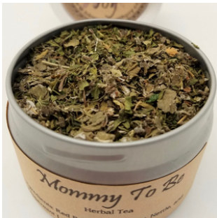
Mommy To Be

Chamomile Flowers, Lavender Buds, Meadowsweet, and Ginger Root