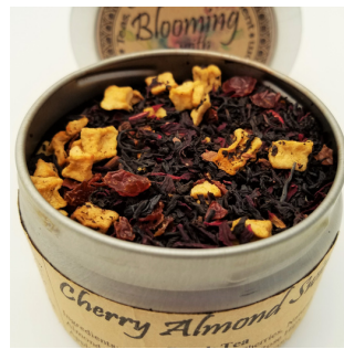
Cherry Almond Swirl

Black Tea, Cocoa Nibs, Natural Caramel, Vanilla, and Chocolate Flavors