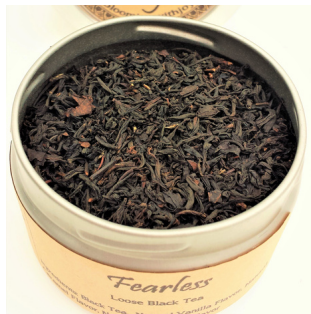
Fearless Black Tea, Natural Black Currant, Vanilla, Caramel, and Bergamot Flavors