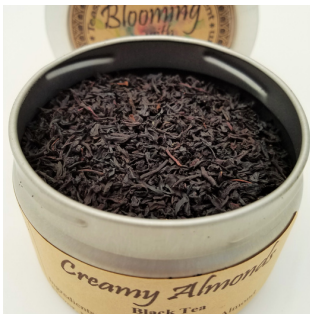
Creamy Almond Black Tea, Natural Almond, and Cream Flavors