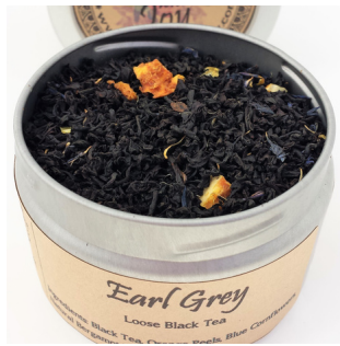
Earl Grey Black Tea, Orange Peels, Natural Bergamot Flavor and Blue Cornflowers