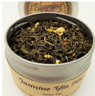
Jasmine Yin Hao

Green Tea, Cinnamon Bark, Orange Peels, Ginger Root, Cardamom, Cloves and Natural Spice Flavor