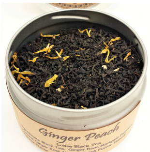
Ginger Peach Black Tea, Ginger Root, Marigold Flowers, Natural Peach, and Apricot Flavors