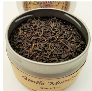
Gentle Morning English Breakfast Black Keemun Tea