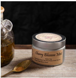
Cherry Blossom Mint

Green Tea, Peppermint, Rose Petals, Cherries and Natural Cherry Flavor