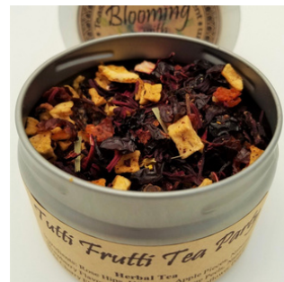
Tutti Frutti Tea Party

Apple, Orange Peel, Ginger Root, Cinnamon, Turmeric, Rose Hips, Peppercorn, Mango, Marigold Flowers, Natural Orange and Mango Flavors