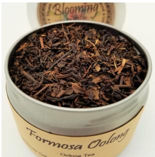
Formosa Oolong Oolong Tea