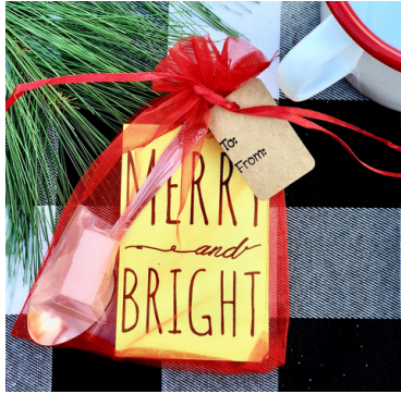
Merry and Bright