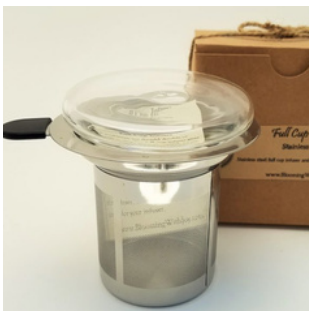
Full Cup Infuser Stainless Steel Infuser with Lid and Direction Price $ 25