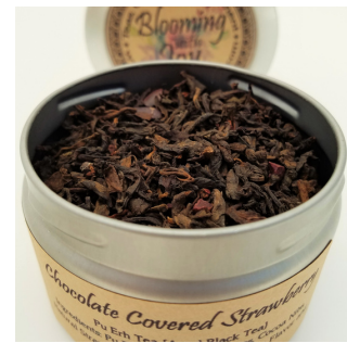
Chocolate Covered Strawberry

Black Tea, Dried Cherries, Hibiscus Flowers, Rose Hips, Apple Pieces, Natural Almond and Cherry Flavors