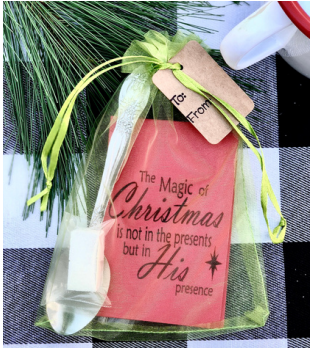
Magic of Christmas is in His Presence