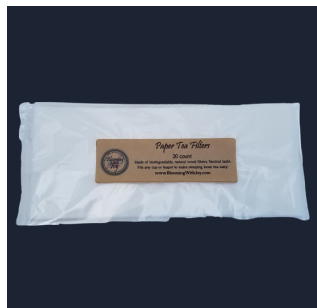
Paper Tea Filters Wood Fiber Tea Filters 20pk Price $ 3