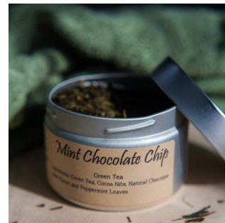
Mint Chocolate Chip

Jasmine Green Tea, Jasmine Flower Petals